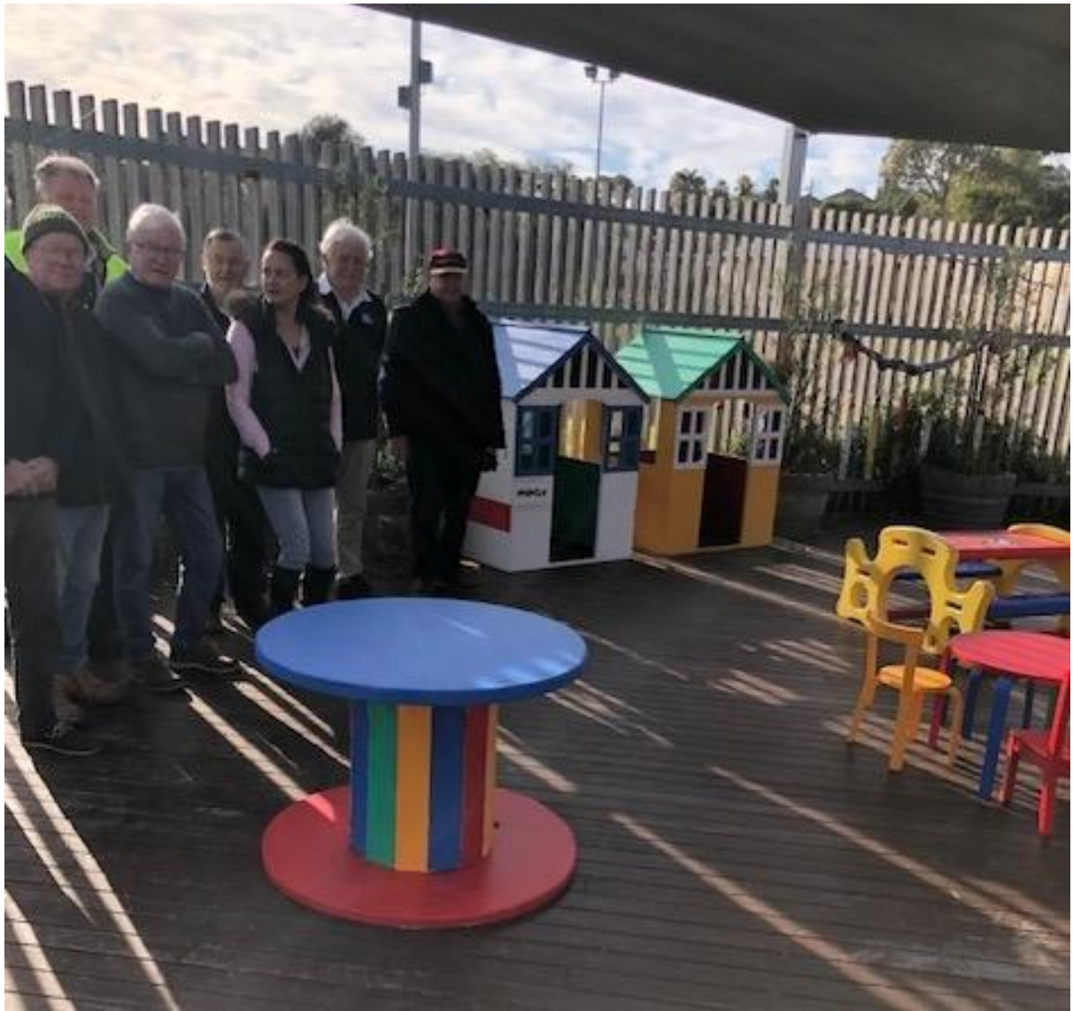
What a great job from all involved.